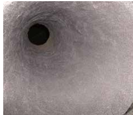
Steel cone coated in Belzona 1812

For more information, please contact your local Belzona representative: