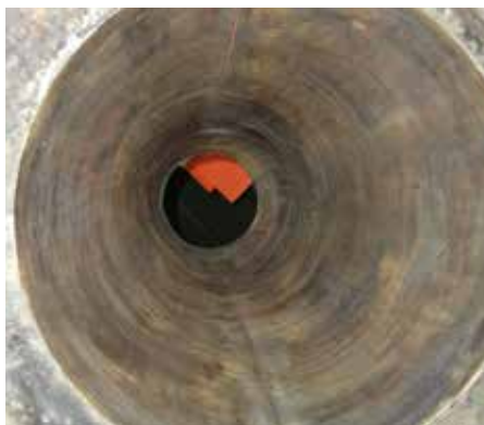
Steel cone before coating