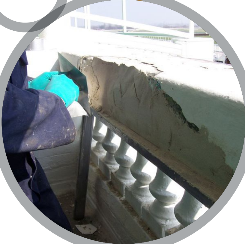
Ornate Stone Repairs

For more information, please contact your local Belzona® representative: