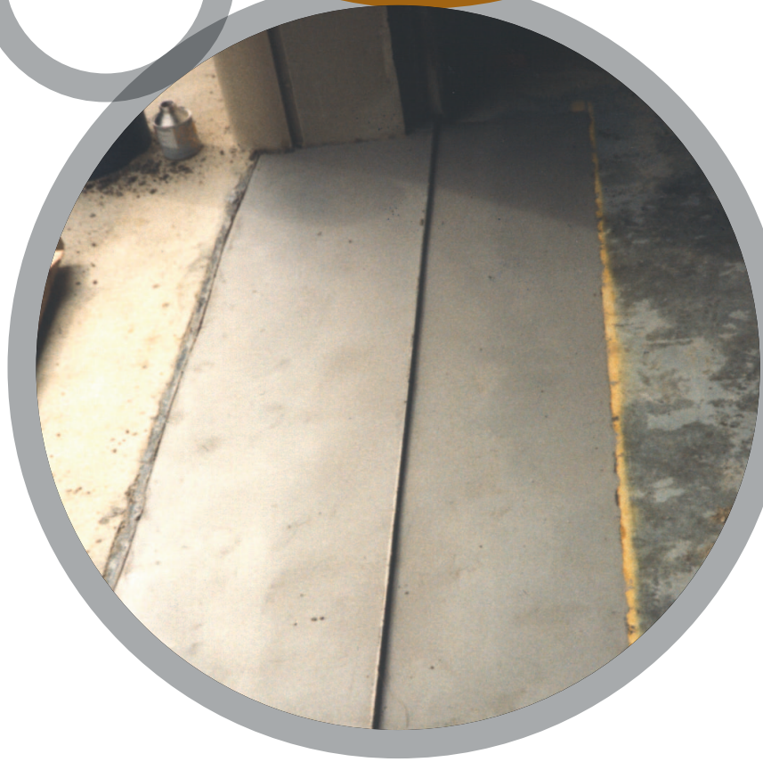
Floor Problem Areas

For more information, please contact your local Belzona® representative: