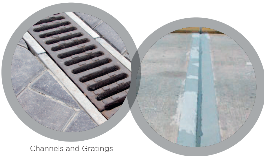
Channels and Gratings