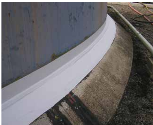
Tank base sealing