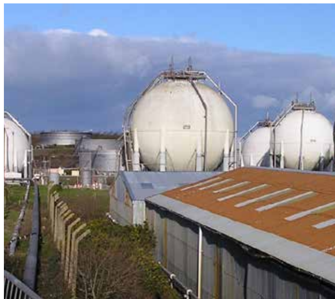
LNG storage spheres

The material provides excellent resistance to liquids such as: oil, chemicals and water; steam impingement; infra-red and ultra-violet radiation; and fire.