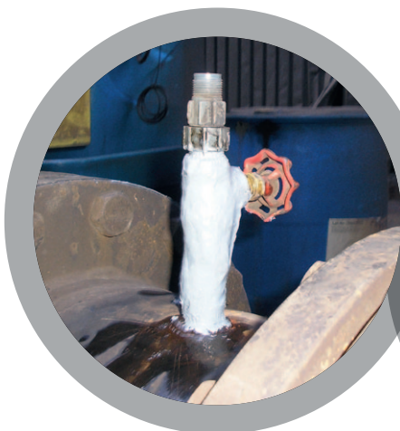
Leak Sealing of Pipework