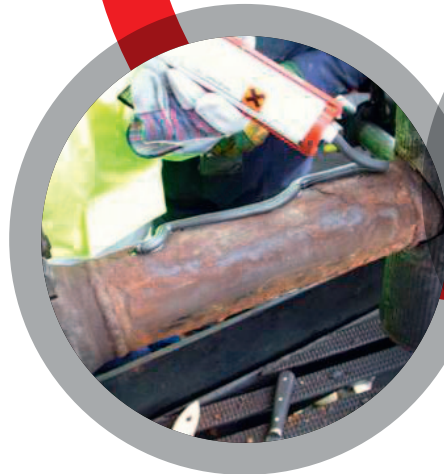
Bonding Doubler Plates