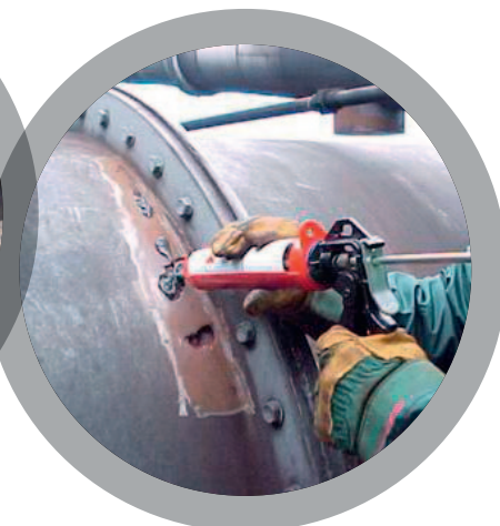
Infill of Corrosion Pits