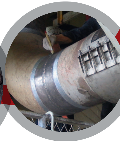
Repair to Welds